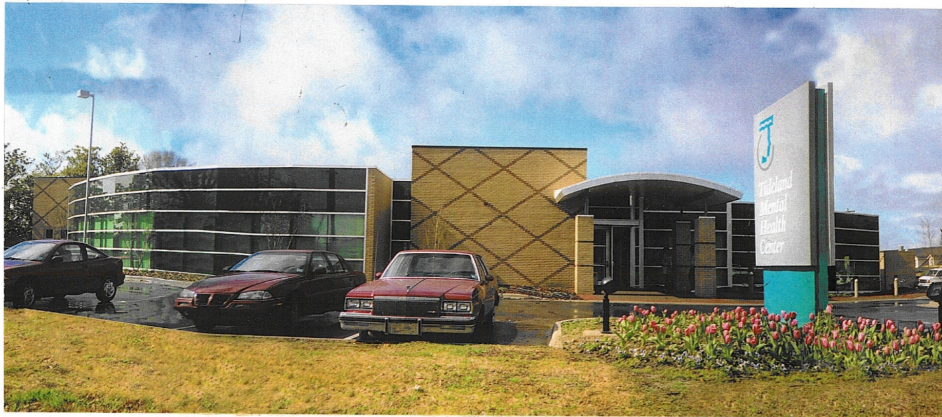
View from Highland Avenue